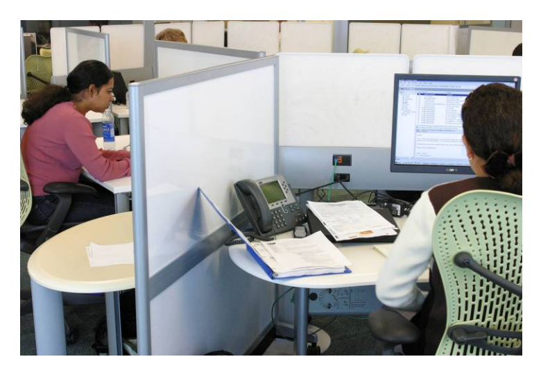
Figure 5. Workstation with Docking Station, IP Phone, Keyboard, and Screen

· Individual workstations, equipped with: