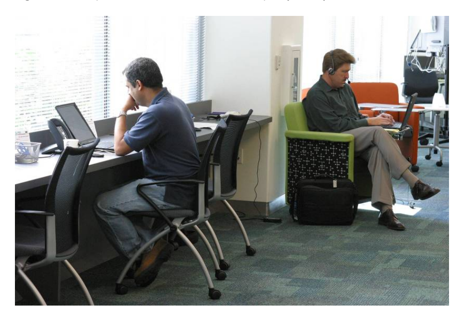
Figure 8. People Use Wired and Wireless IP Telephony to Stay in Touch