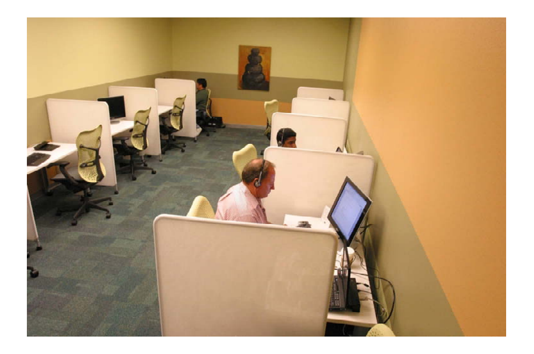
Figure 7. "Library" Area Within the Connected Workplace Building