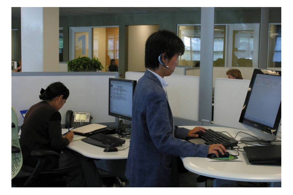
Figure 9. Employees Requested Flexible Work Station Heights that Can Be Customized for Different Needs

room when privacy is no longer needed, they regain the collaboration and informal interaction that's key to organizational success, and also release a resource that others might need. That's the big-picture view we try to encourage."