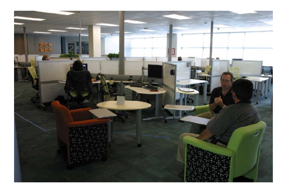
Figure 1. Movable Furniture Makes Collaboration Easier

• Encouraging collaboration. The floor plan would provide spaces for both planned and spontaneous meetings (see Figure 1) and for small and large groups. Technologies that encourage collaboration over distance include Cisco VT Advantage for video telephony, Cisco Meeting Place for audio- and videoconferencing, interactive white boards, instant messaging, e-mail, and voice mail. Other technologies that encourage