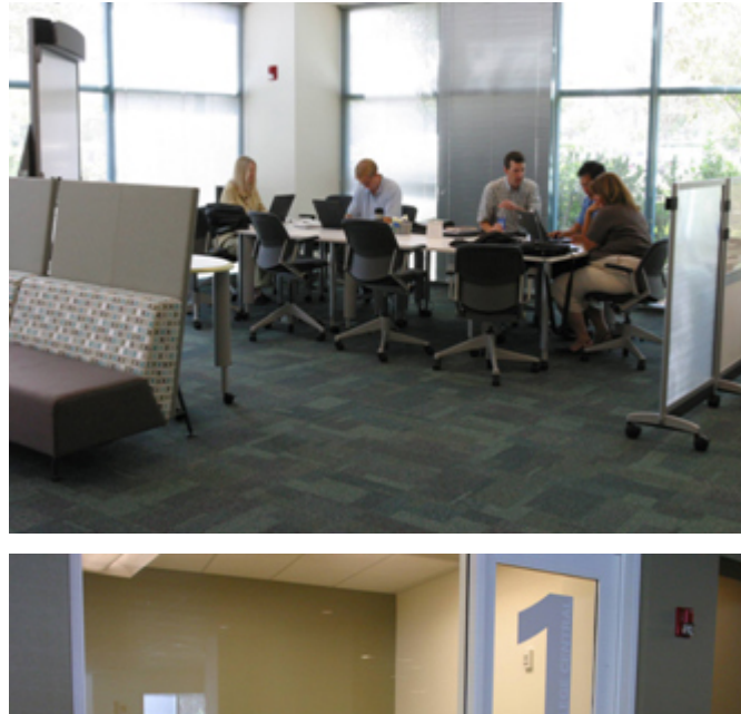
Figure 6. Informal and Formal Meeting Areas